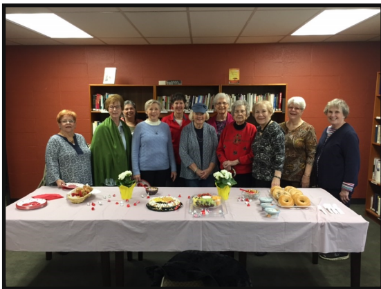
Pictured above are the ladies who attended the Rebecca Circle Small Group on February 20.

In March, they will be collecting Kid Friendly Food as their service project. All items collected will be donated to Circle of Concern. Their hope is that this food will fill a need of families during Spring Break when kids are not at school. Donations may be placed in the marked basket in the hallway by the church office.