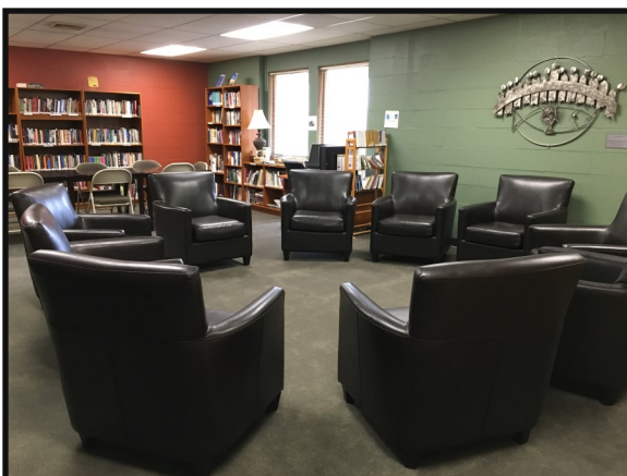
Beautiful new carpet in the CCC Library

If you haven't checked out the Nursery and attached kid's area recently, take a look at the beautiful new flooring. Then wander on over to the Library and look at the new carpet. These purchases were made thanks to a donation from the Stable Sale. They are working hard preparing for the May sale and helping those in the community who have been impacted by hard times. A big thank you to the Stable Crew for the wonderful flooring and for always being there for our community!