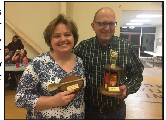
Chili Cook-off winners with their trophies!

The Elders want to thank everyone for their participation and support!