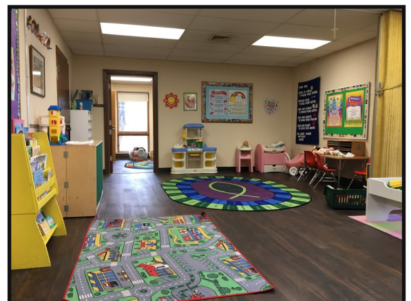
New flooring in the children's preschool area