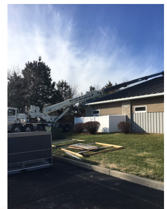
HVAC installation 1-7-20

Thank you everyone for your generous support in 2019.