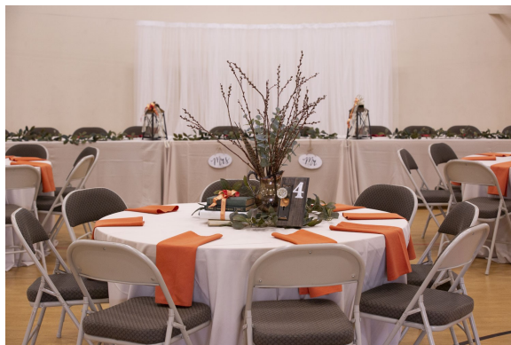
A “transformed” WFLC for special events

CCC 623 Meramec Station Road Manchester, MO 63021